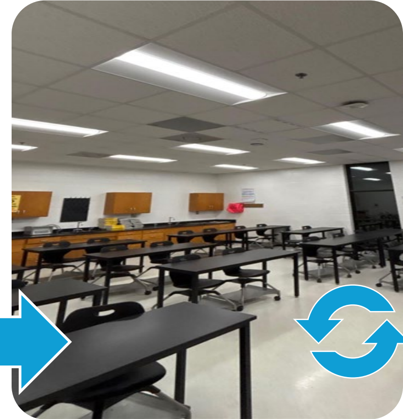
Energy Solutions Provider (Retrofits, Utility, Efficiency)