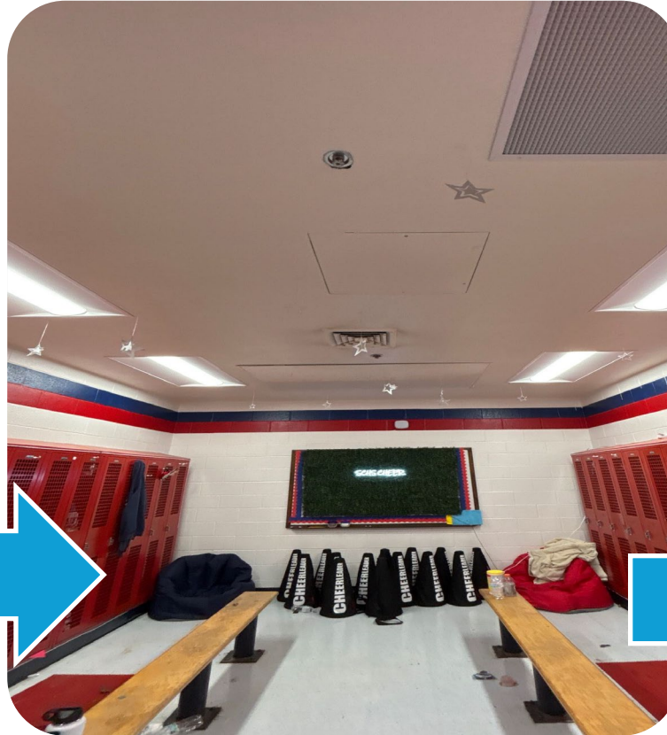
Secondary Sports Facilities (Locker Rooms, Coach Offices)